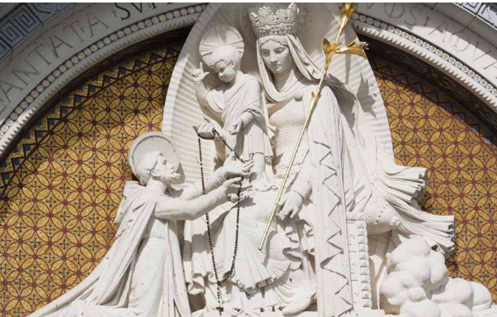
St. Dominic Receives the Holy Rosary

After devotion to Our Lord Jesus in the Blessed Sacrament, “the holiest and solidest of all devotions” is devotion to Our Lady - St. Louis de Montfort