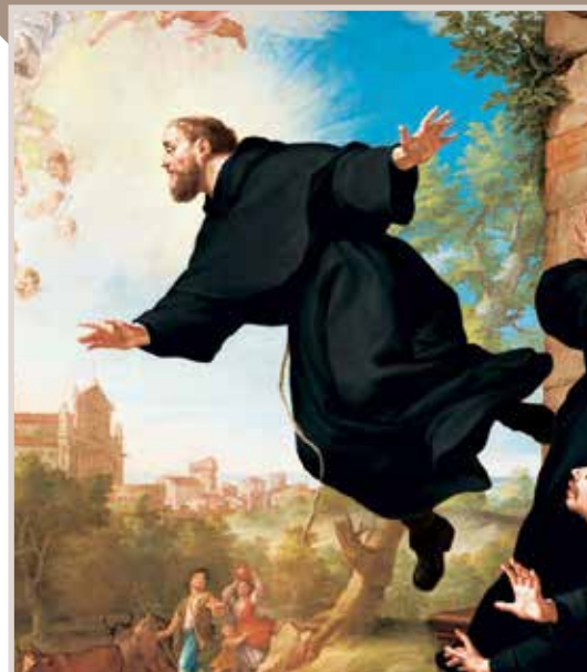
FEAST DAY: SEPTEMBER 18TH

Why that feast day? St. Joseph of Cupertino was the worst student in his class. In fact, Joseph’s story is one of the most hard-luck stories in history, Christian or otherwise. He was rejected by almost everyone he came across, and some rejected him on numerous occasions. At one point, he was given the job of merely taking care of a mule, although no one thought he could accomplish even that task properly.