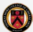
THOMAS MORE COLLEGE OF LIBERAL ARTS